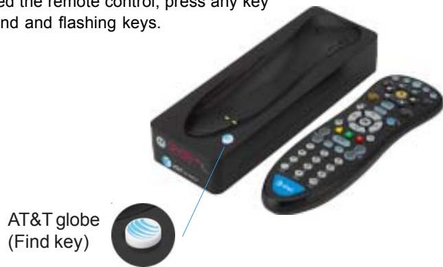
AT&T globe (Find key)

STEP 2. Once you have located the remote control, press any key on the remote to stop the sound and flashing keys.