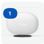
AT&T All-Fi™ Hub