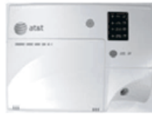
Unidad Delta de dos piezas