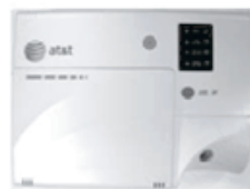
Delta Two Piece PSU