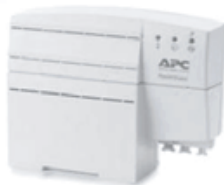
Delta One Piece PSU

If you have an ONT, the PSU will be located inside your home, apartment or garage (within 100 feet of the ONT), and will look like one of the following: