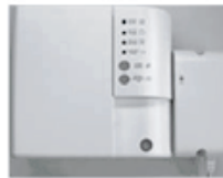
APC Power Shields PSUs (Two models that look the same; model numbers CP24U12 & CP27U13)