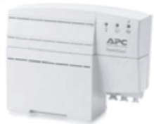
Unidad Delta de una pieza